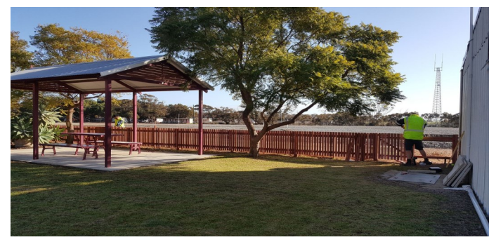
Above: The new fence to prevent access to the railway line, creating a safe picnic area.