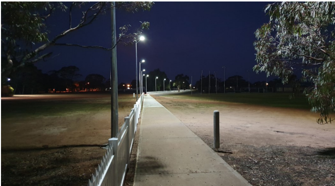
Above: The lights showing the way from the Lake Grace Medical Precincts to town.

The Lake Grace Maintenance Grader has carried out grading, rolling and backslope maintenance on: