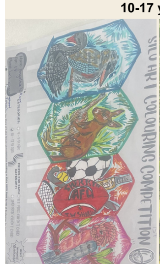
1st Place Angelica, 13 years