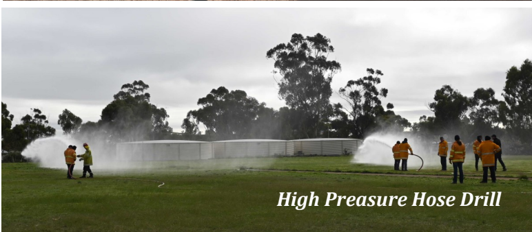
High Pressure Hose Drill