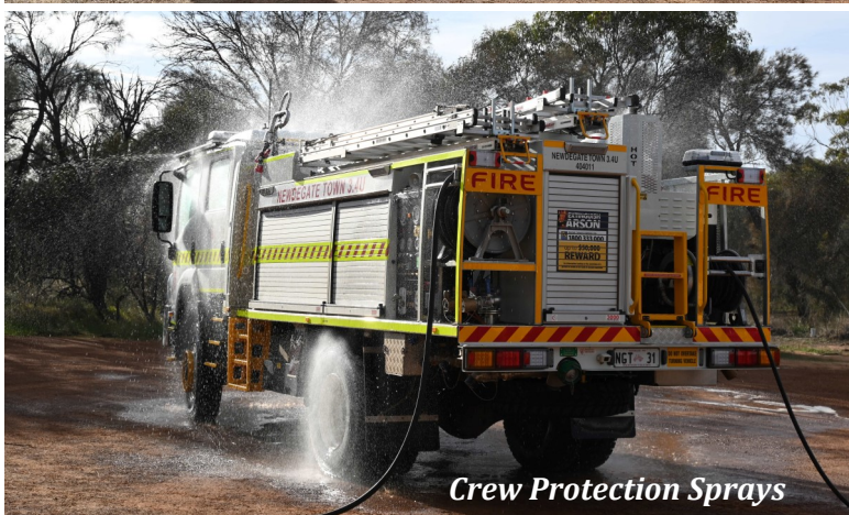
Crew Protection Sprays