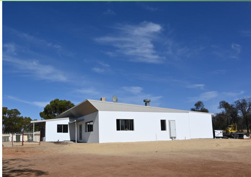
Above: Newdegate Country Club extensions