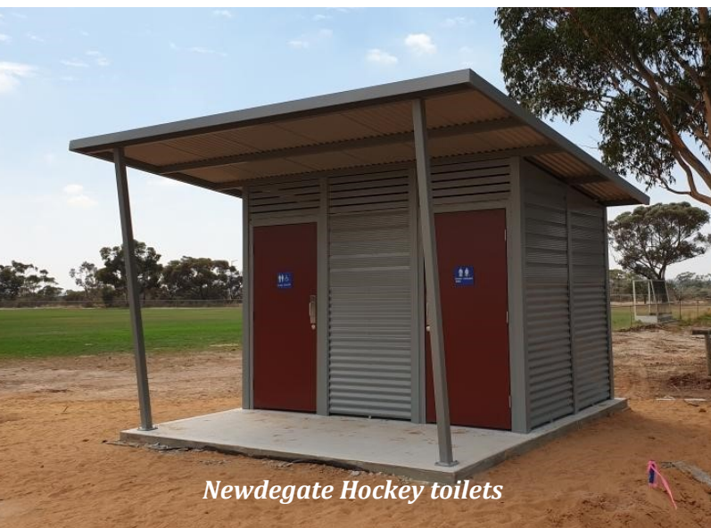
Newdegate Hockey toilets